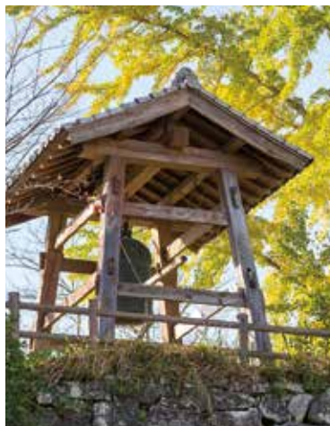
Genroku no jisho (time bell) was built more than 300 years ago and the elementary school students still rings it today.