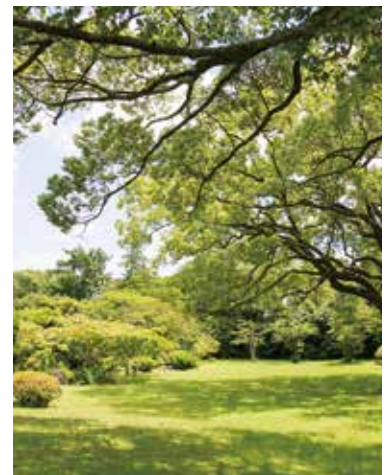
You can't miss this beautiful garden "Tekisansou", which was the house of a gold mine owner (10 a.m. - 4 p.m. No charge for entrance).