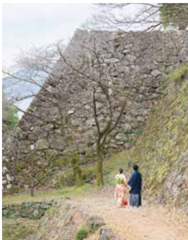
Watching stone walls (Anou zumi) built about 400 yrs ago and reminiscence the ancient time.