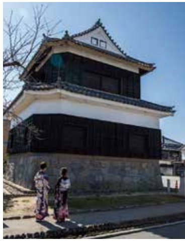
Local guides who are familiar with history will give you the guidance for Kimonyagura (scaffold) *closed on Mondays.