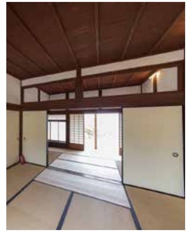
Spectacular view from Chidoukan - the domain school still existing today only in Hiji Town in Oita Prefecture. closed on Mondays.