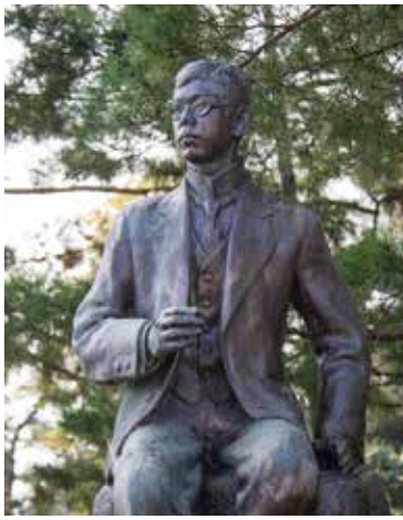
The ancestor of Rentaro Taki (famous composer) was Karo (chief retainer) of the domain of Hiji.