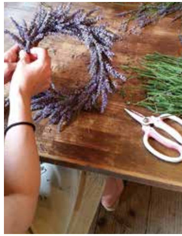
Workshop where you can experience making wreaths, crafts and aroma candles.