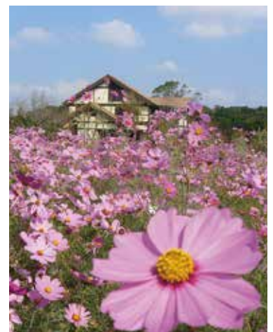
Cosmoses tremble in the wind and get ready for winter (October)