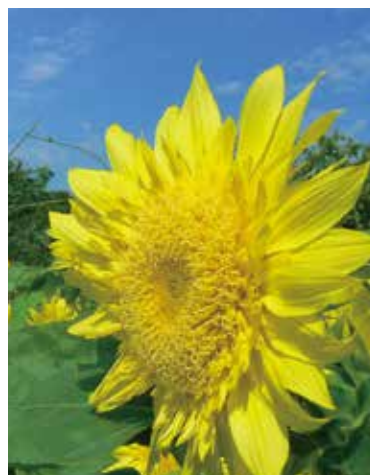
Enjoy your summer at the field of yellow sunflowers (July - August)