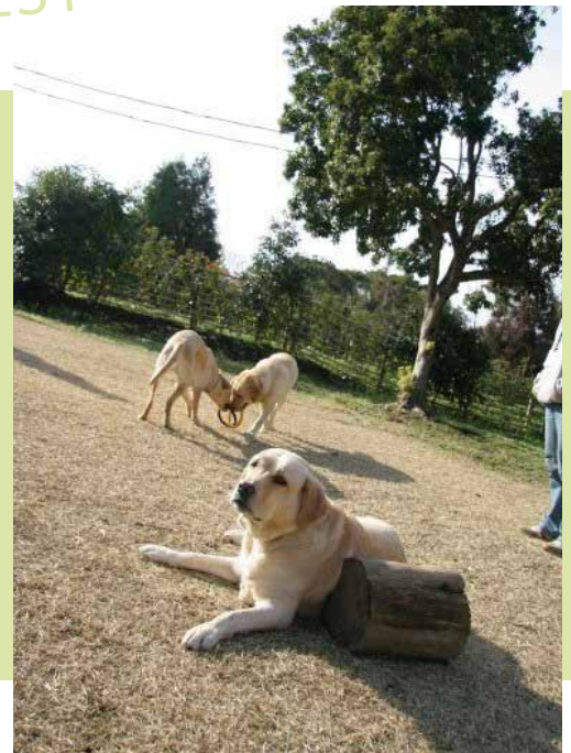
Highly Recommend! 1500-m2 Dog park (¥500 per a dog)

Oga Farm surrounded by the coastline with panoramic view of the Beppu-wan Bay and beautiful woods produce the peaceful space. We offer you a slow living style which enriches your heart, with harmonizing with nature.