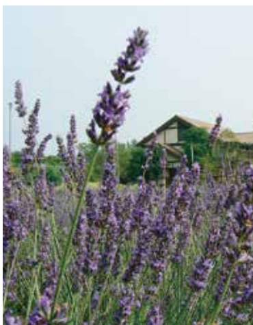
Purple lavenders swaying gently (June)