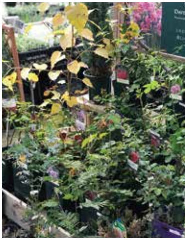
Seedling Market, Farmer's Market selling the roses, herbs and fruit trees.